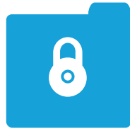
Hosted Document Management