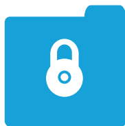
Hosted Document Management