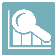
Insights & Analytics