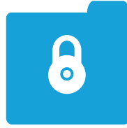
Hosted Document Management