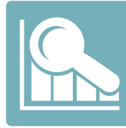
Insights & Analytics