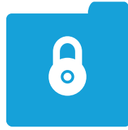
Hosted Document Management