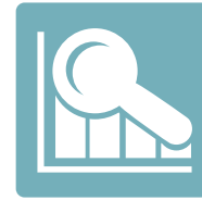
Insights & Analytics